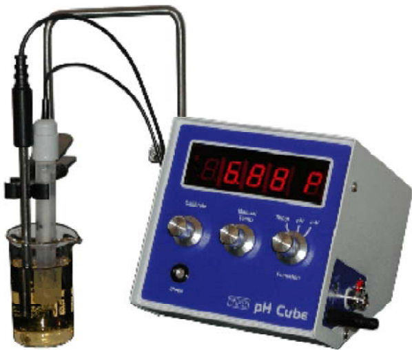
Full Size Image